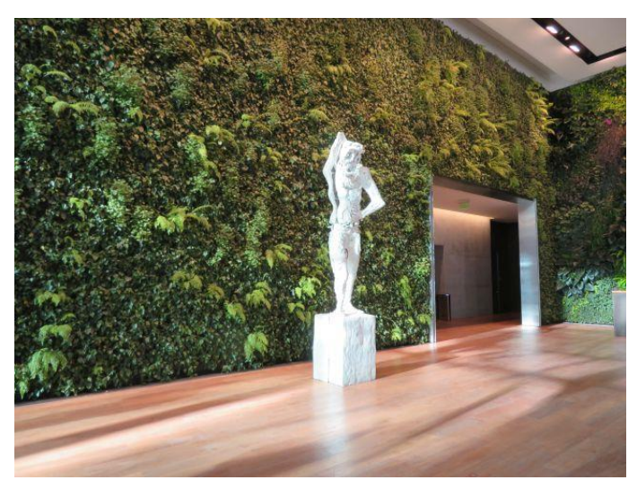
Sculpture by Thomas Houseago and a living wall at Foundry Square III

Eleven. Continue on First to Howard, where we notice the cluster of buildings surrounding the intersection, called Foundry Square. There are outdoor plazas with art and indoor lobbies too in all these buildings, which were completed just a few years ago. We check out the building at the southeast corner, 505 Howard, aka Foundry Square III, with a living green wall and some strange figurative sculptures by Thomas Houseago.