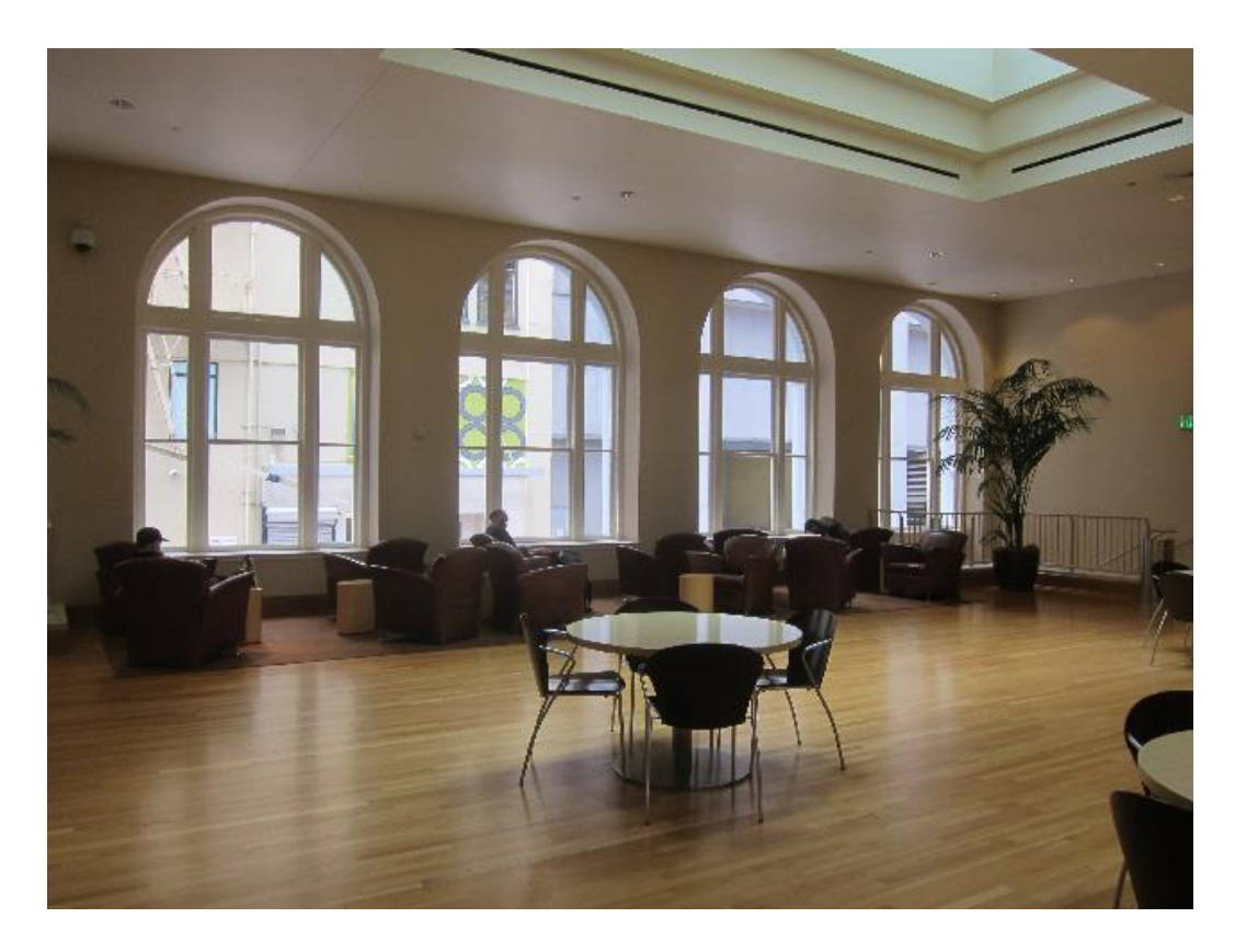
Relaxing interior attached to 55 second Street

Seventeen . Speaking of Willis Polk, 55 Second Street , a 2002 tower by Heller Manus, provides its public open space in an attached building on Stevenson Street. (Notice the eagle atop its attractive façade. Designed by Polk as a post office, if I'm not mistaken, with nicely arrayed arched windows. A popular spot for brown bag lunches today, plus you can rent it for events. It is filled with good art by disabled and formerly homeless artists.