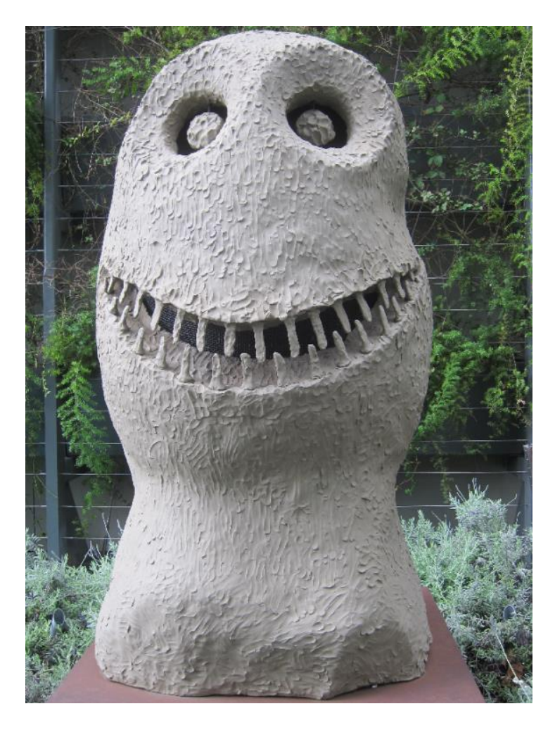
Sculpted heads by Ugo Rondinone serve as vents at 555 Mission Street