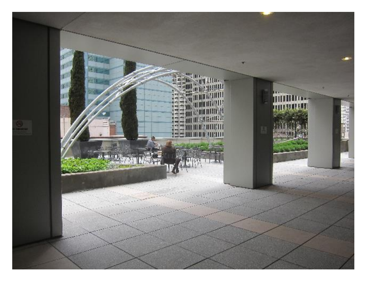
Garden Terrace, 150 California

Six . 150 California , an imposing tower designed by HOK in 1990 has a "Garden Terrace" on the sixth floor. Pleasant little courtyard; building provides large overhang so you can enjoy the outside even when it rains. Nice view of the garden and courtyard at 101 California across the street. Also, lobby has good glass art, including a monolith by Howard Ben Tré.