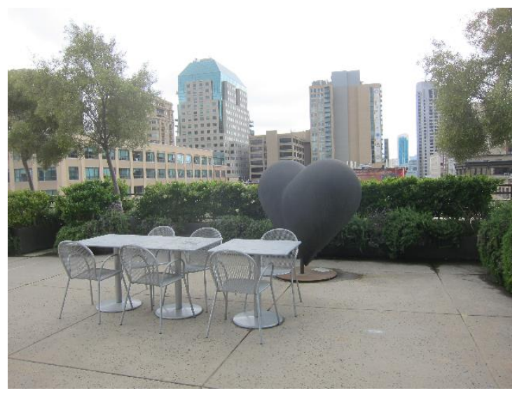
The view from 543 Howard

Eleven. Continue on First to Howard, where we notice the cluster of buildings surrounding the intersection, called Foundry Square. There are outdoor plazas with art and indoor lobbies too in all these buildings, which were completed just a few years ago. We check out the building at the southeast corner, 505 Howard, aka Foundry Square III, with a living green wall and some strange figurative sculptures by Thomas Houseago.