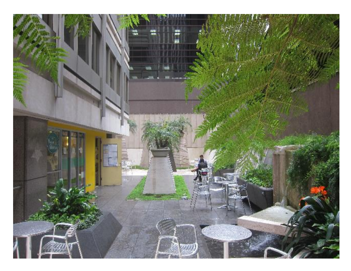
100 Pine, a hidden oasis