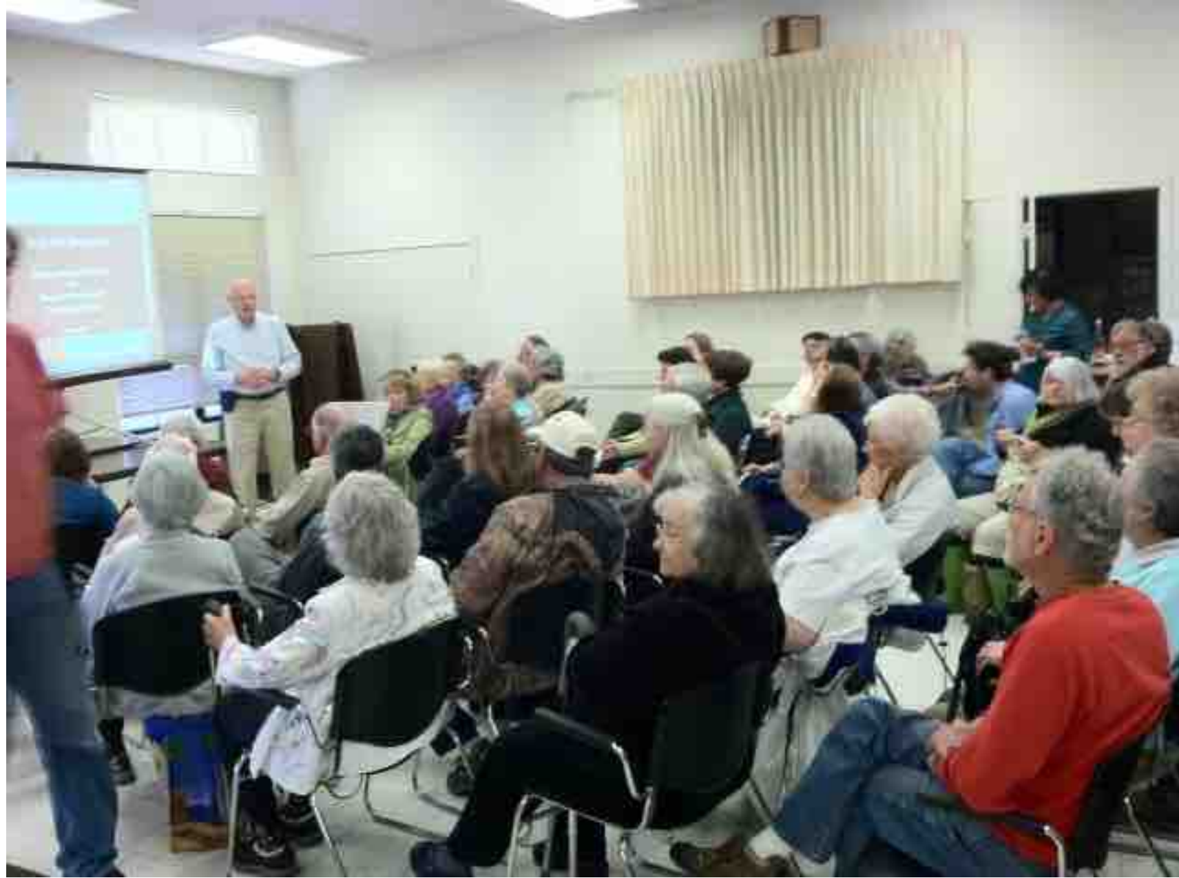
The main presenter was a savvy collector - this is not her 😊