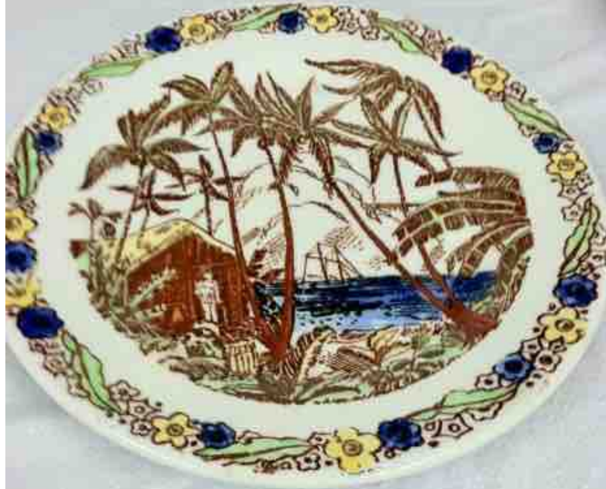
Tropical Island Plate